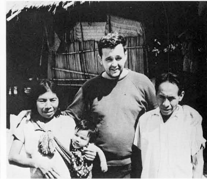
The author with his Cashinahua father, (the old head-man), mother, and niece.