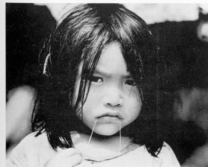
This pensive four year old chews her necklace as she ponders the activity of the photographer.