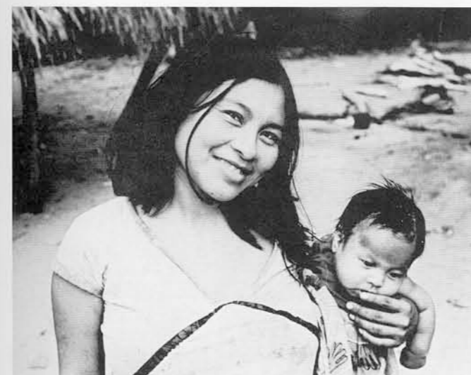
This giggly young lass of about eighteen holds the younger of her two children.