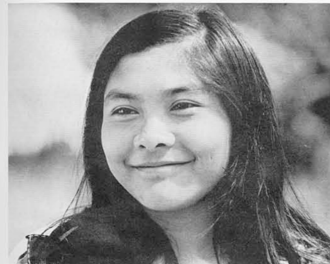
A young Cashinahua beauty.

Since 1955, the Cashinahua have moved progressively closer to Esperanza, so that at present the most upriver village is less than half the distance from the mouth of the Curanja to the village where I began my studies. One village on the Purus River, composed entirely of recent Brazilian migrants, is less than two hours by canoe from Esperanza, where the establishment of a Catholic mission and school and the initiation of biweekly DC-3 air service from Pucallpa