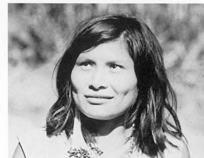
A young woman wearing earrings made of beads from Czechoslovakia and locally grown seeds.