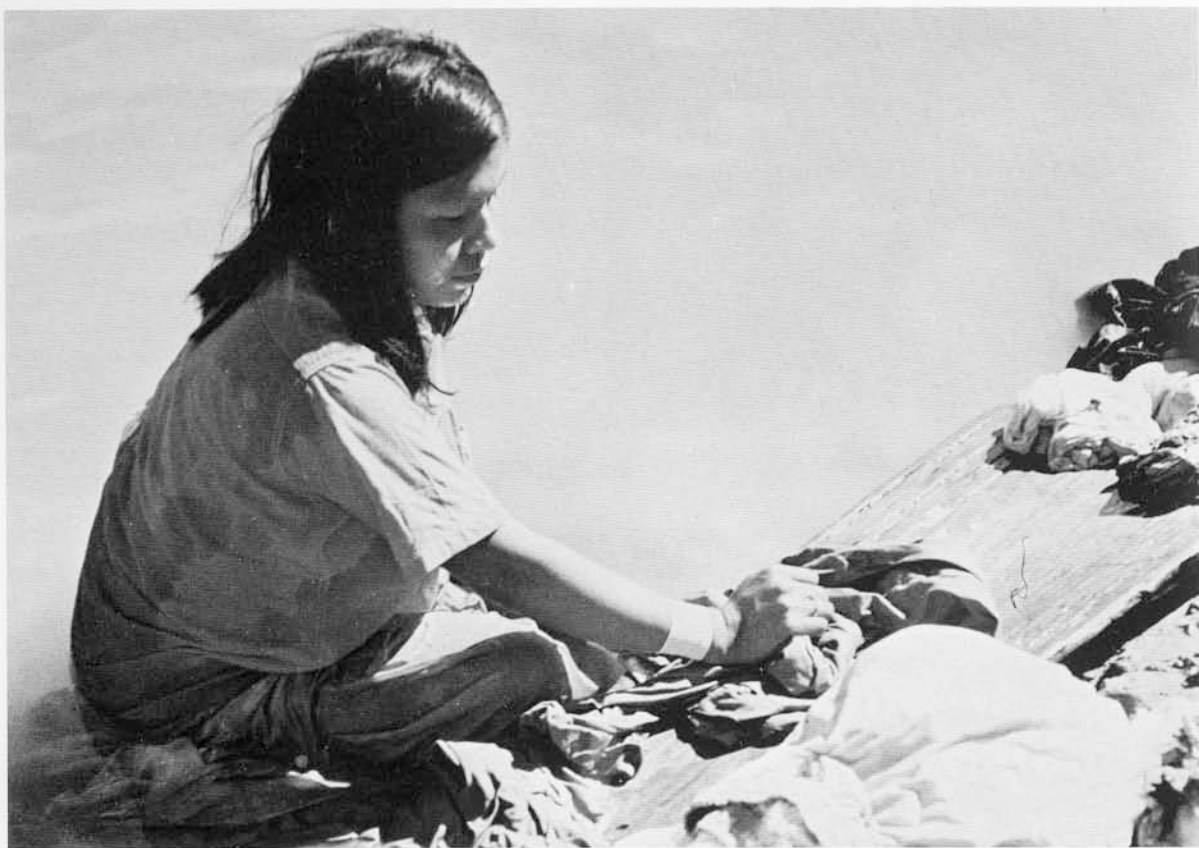
"Alice" doing the laundry.