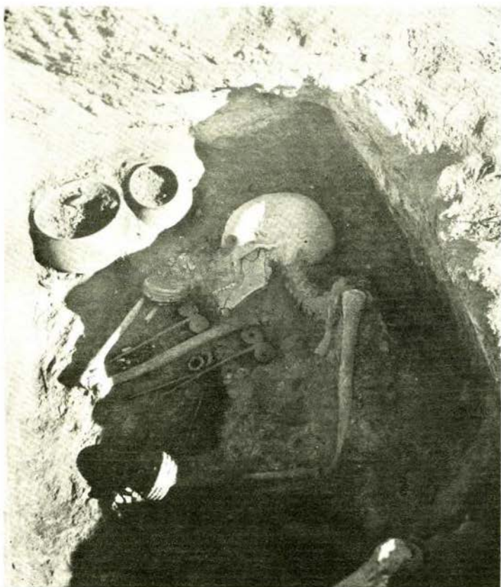
EARLY BURIAL OF THE 'GRAY POTTERY STRATUM,' DAMGHAN, PERSIA