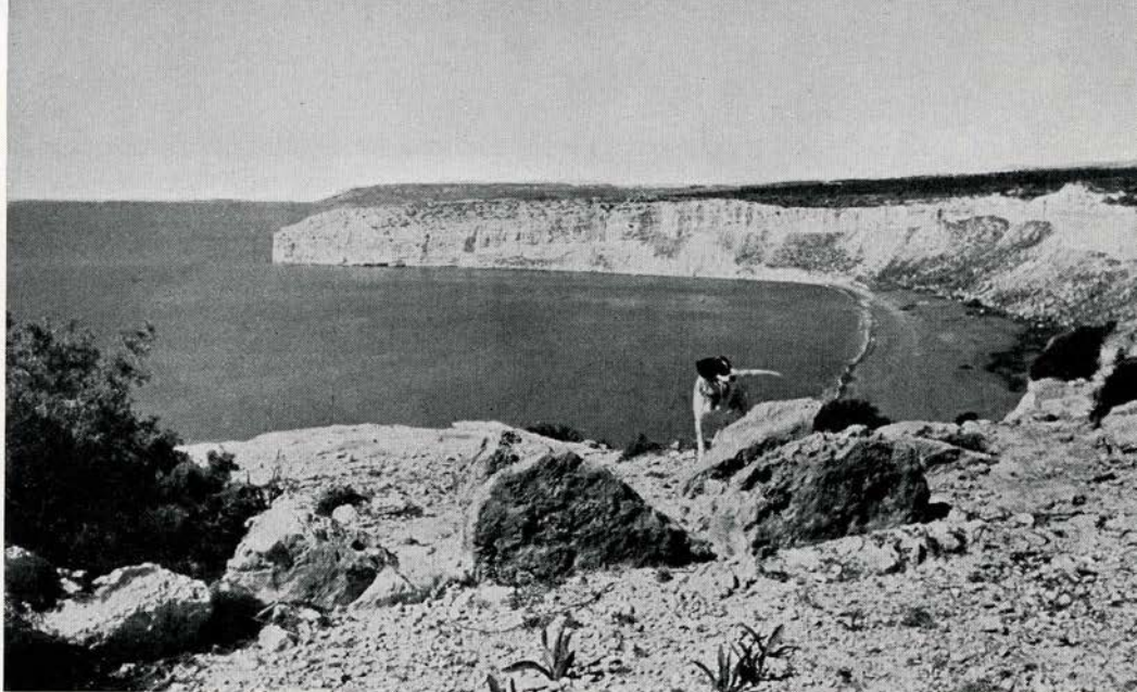
Overlooking the Mediterranean near the site of ancient Kourion, Cyprus