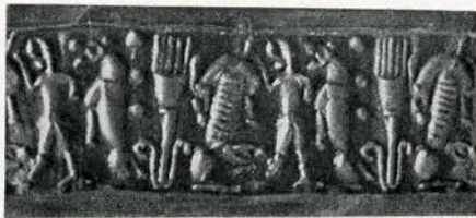
Impressions of two cylinder seals