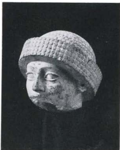
Figure 37. Head of Gudea found at Nippur. (Lent by the Philadelphia Museum of Art.)

The style of the Gudea period ( Figure 36 ) is smooth and "classical" in contrast to the archaism of Urnina. Two small Gudea heads may be seen in the Babylonian Section. They are cut in grey-black diorite. The turbaned heads, with large open eyes, bushy eyebrows, straight nose, small mouth and round chin, are true to type. One was found at Nippur ( Figure 37 ), the other comes from Lagash. The latter fits on a body now in the Baghdad Museum, which shows Gudea seated on a bench, in front of his god Ningishzida, according to the inscription engraved across his knees, and with hands clasped as becomes a worshipper. (cf. Museum Journal , September, 1927; Bulletin , May, 1937.) The Lagash head ( Figure 38 ) was acquired by purchase. The Nippur head is a loan from the Philadelphia Museum of Art. (cf. L. Heuzey, Découvertes en Chaldée , 1884-1912.)