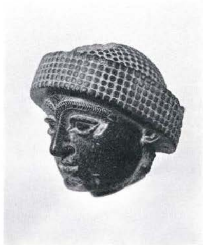
Figure 38. Head of Gudea, patesi (prince) of Lagash. On the body, which is in the Baghdad Museum, is an inscription to his patron god