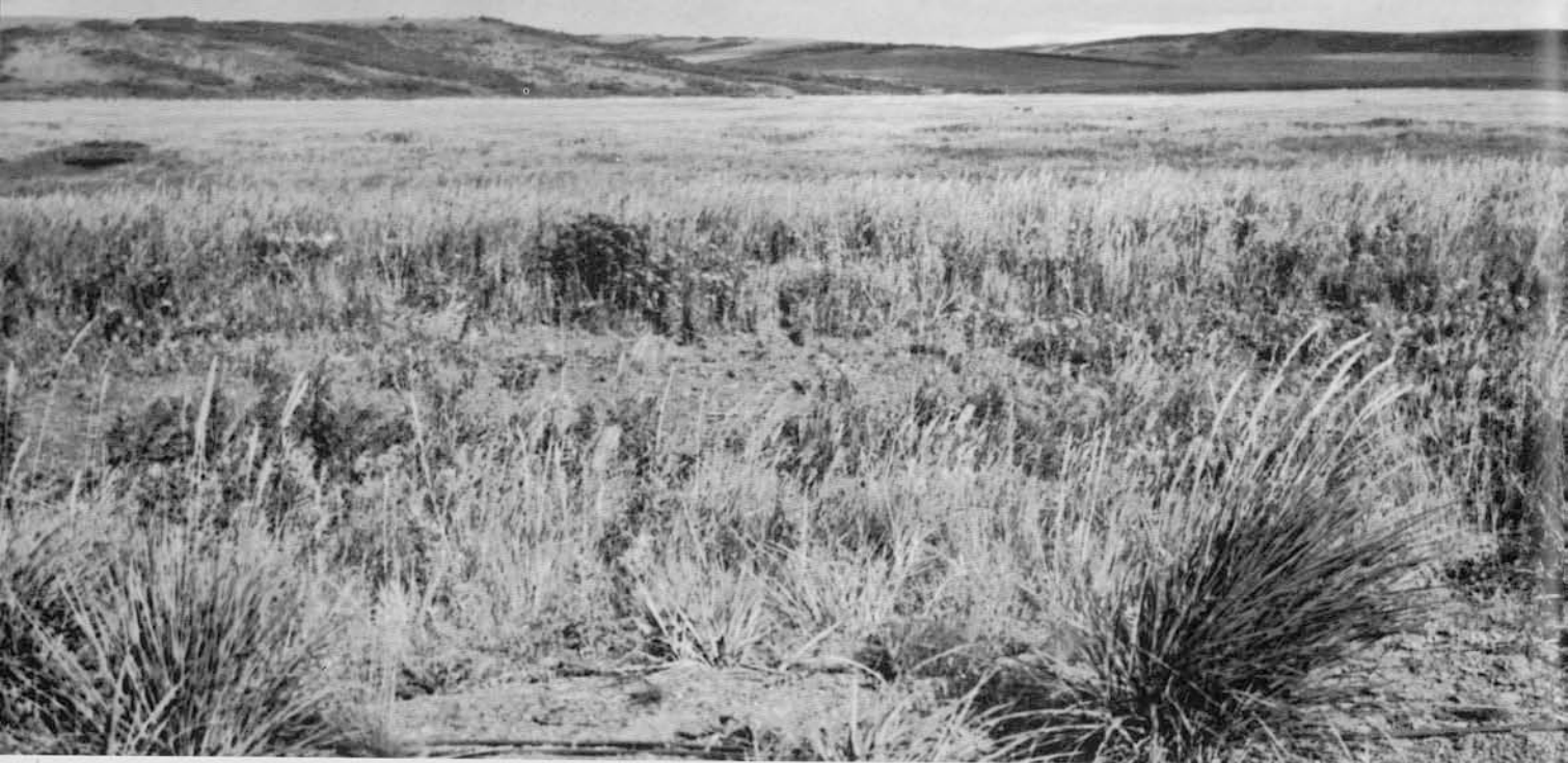
Part of the site as seen from the modern beach ridge. Some of the house pits are faintly visible. The excavation of the small square house can be seen on the far left. The hills in the background are wooded and could have provided a source of wood for house construction.

level. These artifacts are quite large and consist of both polished and unpolished jade or greenstone adzes, scrapers, and choppers. A large slate knife, about seven inches in length, was found associated with these objects. Scrapers recovered from all levels within this house also differ significantly from those of Cape Denbigh, those from Cape Denbigh being discoidal while these are nearly all ovoid.