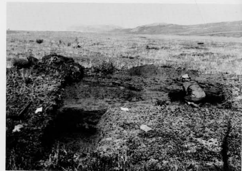
The test pit of the shallow, 24 by 40 foot house. The part of the test pit in the foreground has already been dug beneath the floor, and shows the midden to be about one foot thick.

Also excavated was a house which before digging appeared as an oval depression about ten feet long by six feet wide. It was at first thought that its floor, like that of the house previously described, lay near the surface. Such did not turn out to be the case, for this floor lay about five feet below the surface. Between it and the surface lay many levels of cultural debris which were probably formed in part after the house had collapsed. It is likely that the people who lived in the surrounding houses threw some of their debris into this pit. Interspersed with the cultural debris were lenses of gravel which had probably been thrown up by the sea during