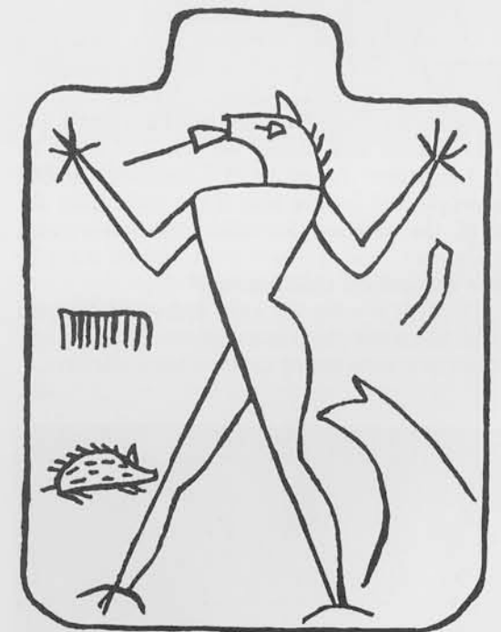
The demon Lamashtu incised on a clay plaque.

In Mesopotamia there were separate incantations for each of the names of Lamashtu in addition to short incantations containing only 'abra-cadabra' and long incantations aimed at the demon in all her aspects. One such incantation describes Lamashtu and then conjures her. "Anu created her, Ea raised her. Enlil allotted her the face of a bitch. (Her) hands are small, (but her) fingers are long (and her) claws are long. Her forearms are dirty. She has entered through the door of the house, she is slipping in through the door socket, she has slipped in through the door socket and is about to kill the baby. She has seized (the child) in the abdomen seven times. Remove your claws! Unloose your arms before the wise magic of the hero Ea overtakes you! The door socket is wide for you, the doors are open. Away! Go out in the steppe. (May) they fill your mouth with dirt, your face with dust and your eyes with finely ground cress seeds. I conjure you by the oath of Ea. May you begone!"