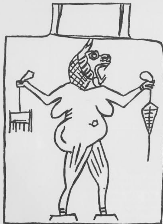
Clay plaque showing the demon Lamashtu as a hideous woman with the head of a lion.

The same type of demon crops up in Christian folklore from Turkey and the Balkans. The