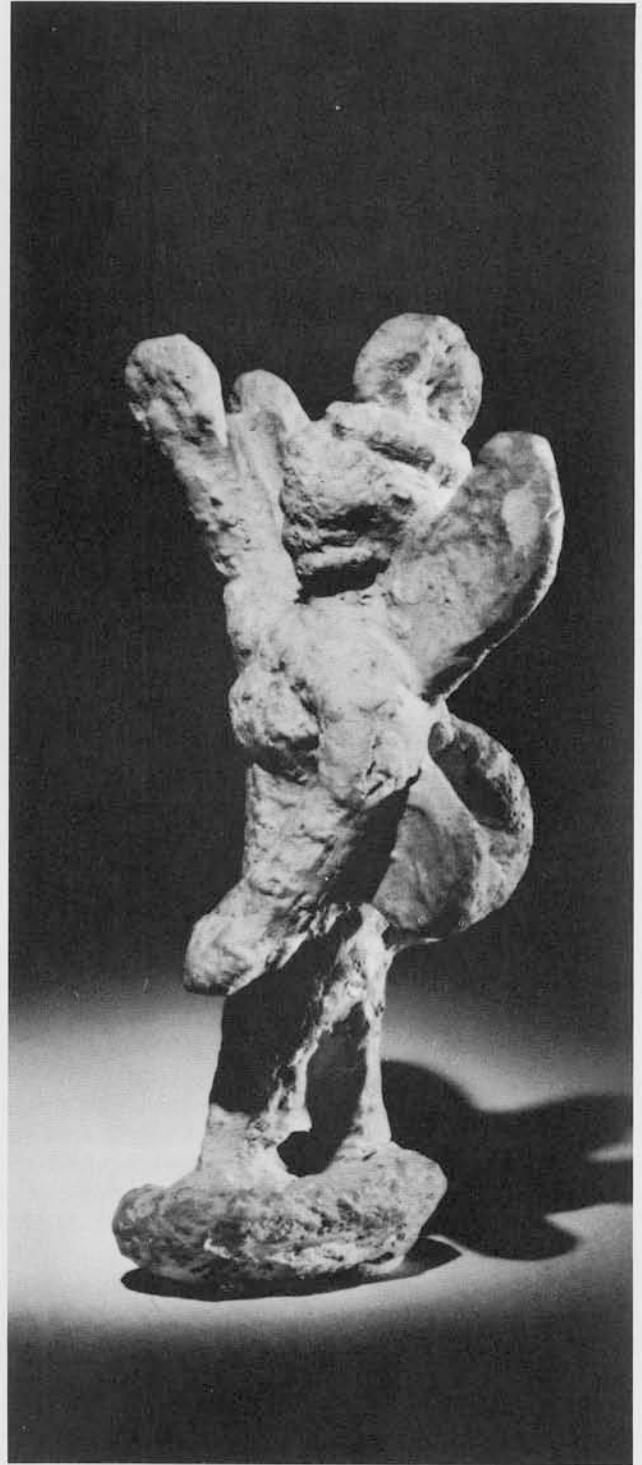
Cast of a winged Pazuzu demon. Such statuettes were inscribed with incantations and worn as amulets.

Dogs like this one were often inscribed and either buried beneath the threshold or placed on window sills to ward off demons.