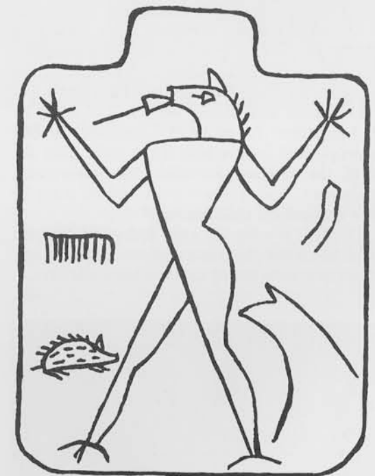
The demon Lamashtu incised on a clay plaque.

In Mesopotamia there were separate incantations for each of the names of Lamashtu in addition to short incantations containing only 'abra-cadabra' and long incantations aimed at the demon in all her aspects. One such incantation describes Lamashtu and then conjures her. "Anu created her, Ea raised her. Enlil allotted her the face of a bitch. (Her) hands are small, (but her) fingers are long (and her) claws are long. Her forearms are dirty. She has entered through the door of the house, she is slipping in through the door socket, she has slipped in through the door socket and is about to kill the baby. She has seized (the child) in the abdomen seven times. Remove your claws! Unloose your arms before the wise magic of the hero Ea overtakes you! The door socket is wide for you, the doors are open. Away! Go out in the steppe. (May) they fill your mouth with dirt, your face with dust and your eyes with finely ground cress seeds. I conjure you by the oath of Ea. May you be gone!"