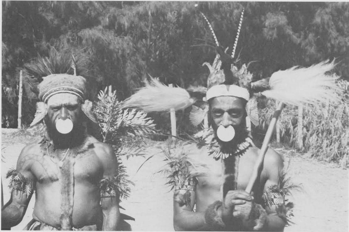
11, 12, 13 Scenes at a wedding in Mingende Village, Chimbu Province.

The costumes and body decorations show the traditional way in which adornment marks impor- tant social events. It is this tradition that has been carried over and adapted for the Mt. Hagen/Goroka Fair.