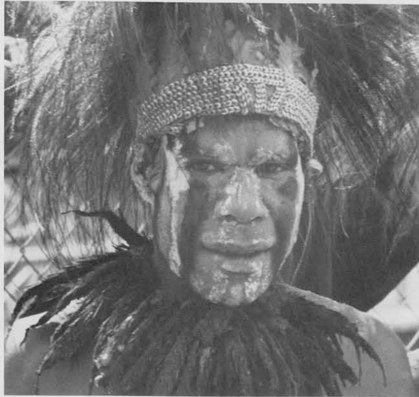
4 Man wearing a bird-of- paradise headdress and a fur collar.