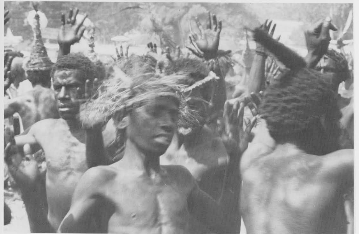
6 An initiation dance.