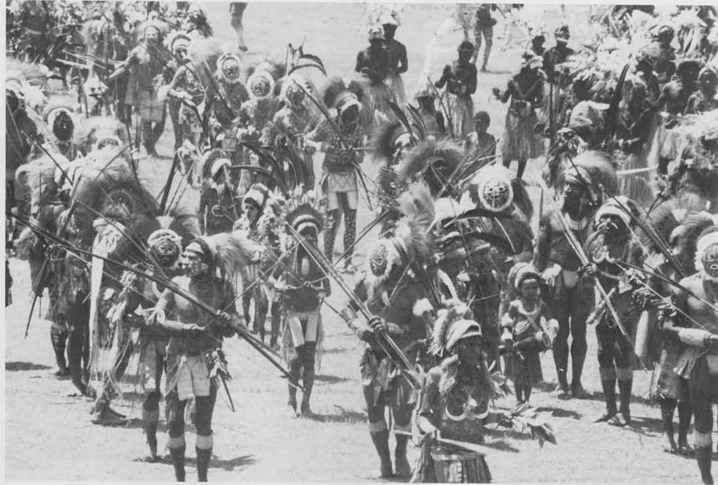
3 Men in masks and makeup for war.