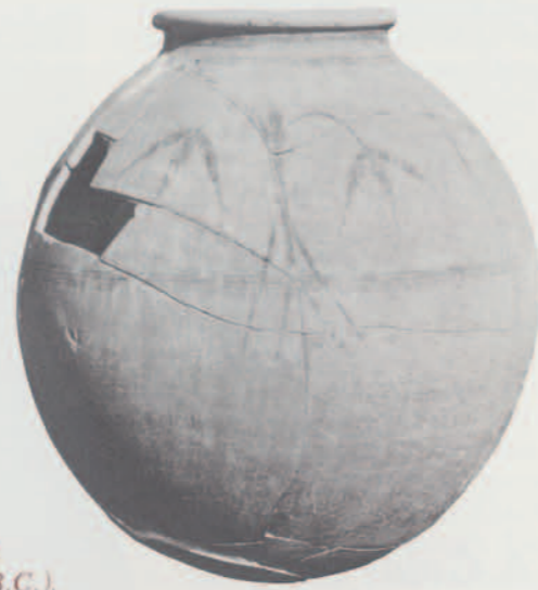
Storage jar with floral motif from the later settlement at Rojdi (ca. 1400 B.C.).

The excavation on the South Extension and on