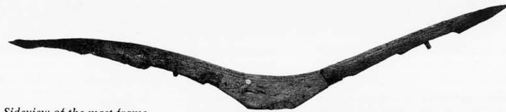
Sideview of the mast frame of one of the Danish ships