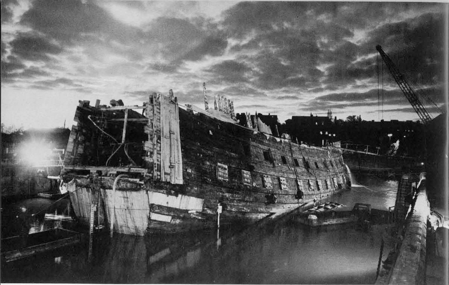
The Vasa being floated in Stockholm harbor