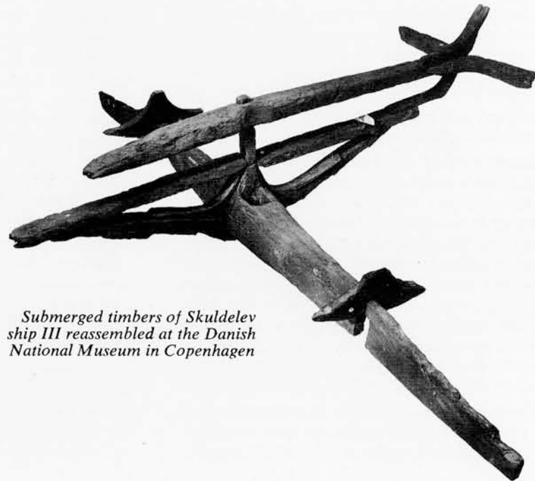
Submerged timbers of Skuldelev ship III reassembled at the Danish National Museum in Copenhagen

measure in his fighting with King Olav of Norway. Or the Danes may have been warring among themselves. An ominous danger must have faced the town, for the settlers would have been reluctant to lose six ships from their trade routes.