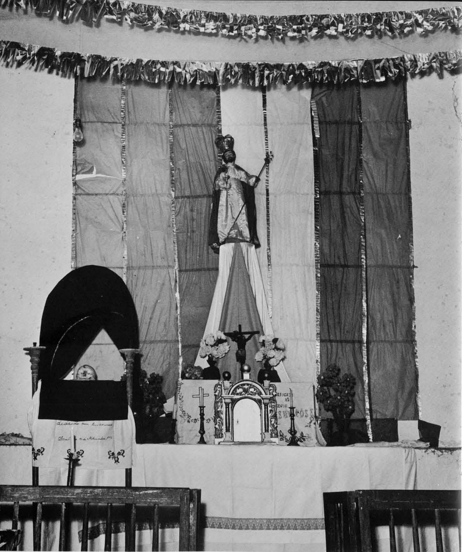
The skull on its temporary altar. During the year, three human skulls are kept on the main altar of the church at San Jose. On the night of November 1st, the one which is to be carried in procession through the village is placed on this especially prepared altar.