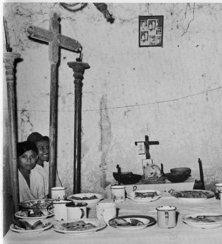
The skull on the home altar. On the large table in the foreground is food for invited guests. However, it is not permissible for them to touch the food surrounding the skull on the small table—that is for the souls. In the picture to the right, prayers are being recited to the skull by the prayer-makers.