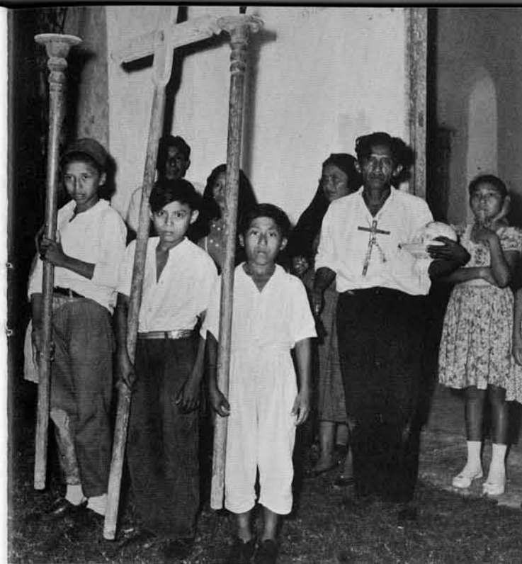
Procession and reception of the skull. The skull is removed from the temporary altar in the church and carried to those who request it, the man in charge being assisted by a small group of volunteers. When the procession reaches a designated house, it is received there in the courtyard by the husband and wife with candles in their hands.

There is also the legend of another man who failed to observe the ritual. He ordered his wife not to make new pottery (as is done for the