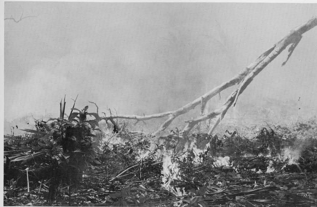
Preparation of maize fields. San Joseños use the slash-and-burn technique of the ancient Maya and have taught it to non-Maya people. It is an effective way to cope with the jungle.

The community itself has advanced equipment including a small electric plant, a modern school building, a water storage tank for rain water, and a dance hall (approximately 80 x 45 feet) constructed of modern material flown from Guatemala City at a cost of $12,000, saved from chicle revenue. Moreover, the adoption of Spanish in all official and city dealings, participation in national political parties, and discussion of national or international issues (such as Kennedy and Nixon while they were candidates for the U. S. presidency) are matters which concern the male population and frequently filter down to some of the women. The sophisticated "up-to-date and matter-of-fact" constitute a modern cultural layer which is functional in dealing with officials, outsiders, or businessmen, as the case