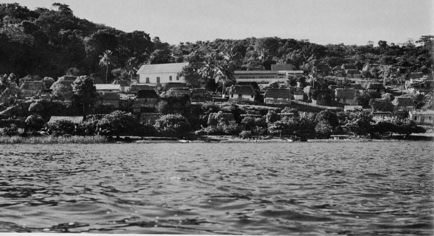
The Village of San Jose. The large white building is the church, and to its right is the school; the other buildings are family dwellings. The tropical jungle can be seen in the background.

been significant because of the variety of traditions they represent. People from Tenosique, Campeche, Merida, Belize, Coban, Guatemala City, and lately Mexico City have migrated to Peten and their cities are places of reference for those San Joseños who have been there and for those who have heard about them. Contact has taken place along trade routes since the time the white man settled there. Natives were sent out to bring in the mail and products of primary necessity including salt, oil, sugar, rice, flour, and kerosene. Furthermore, the operation of lumber camps in the latter part of the 19th and the beginning of the 20th centuries was followed by the exploitation of rubber and chicle, archaeological digging, and geological surveys for oil. Spanish, British, and North American entrepreneurs hired local labor for the exploitation of natural resources.