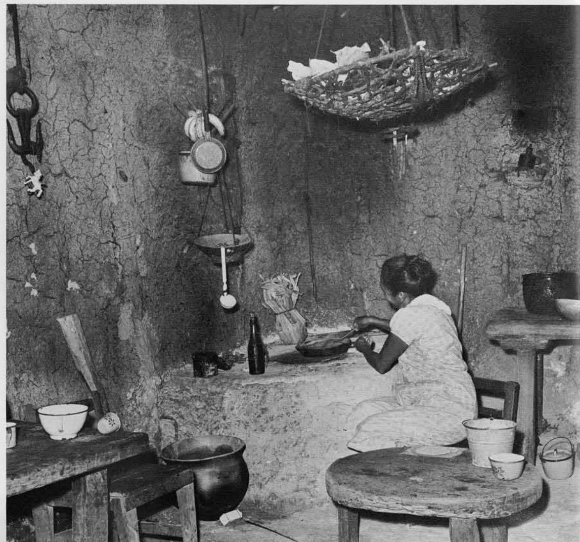
Preparation of ceremonial food. In the kitchen each housewife prepares the food to be offered on the home altar to the souls of relatives and to the guests of the family.

Most villages in Middle America today hold rituals on November 1st to help the souls of departed relatives. Redfield and Villa Rojas report that in Chan Kom, Yucatan, "all souls of the dead return to earth for annual visit and depart . . . tables are arranged at midnight . . . to invite the dead in. Chocolate, bread, and several lighted candles [are placed] on the table . . . one jícara of chocolate, one piece of bread, and one lighted candle [are] set in [the] doorway for souls with no living kin." In the Highlands of Guatemala, Catholics of Maya descent prepare themselves for the visit of the souls of relatives on the same date. There are insignificant variations from village to village as to the time, length, and elaboration of the event. A ritual takes place in the cemetery where much food is left for the deceased. Offerings include liquor, cigars, or sweets liked by the dead. The grave is outlined by many dozens of small, lighted candles awaiting the return of the soul. Relatives spend most of the day feasting and exchanging food with each other. At sunset the people feel that the souls will leave, and the women end the event by dramatizing the departure with expressions of grief. As far as we know, no human skulls are used in the Highlands. San Jose,