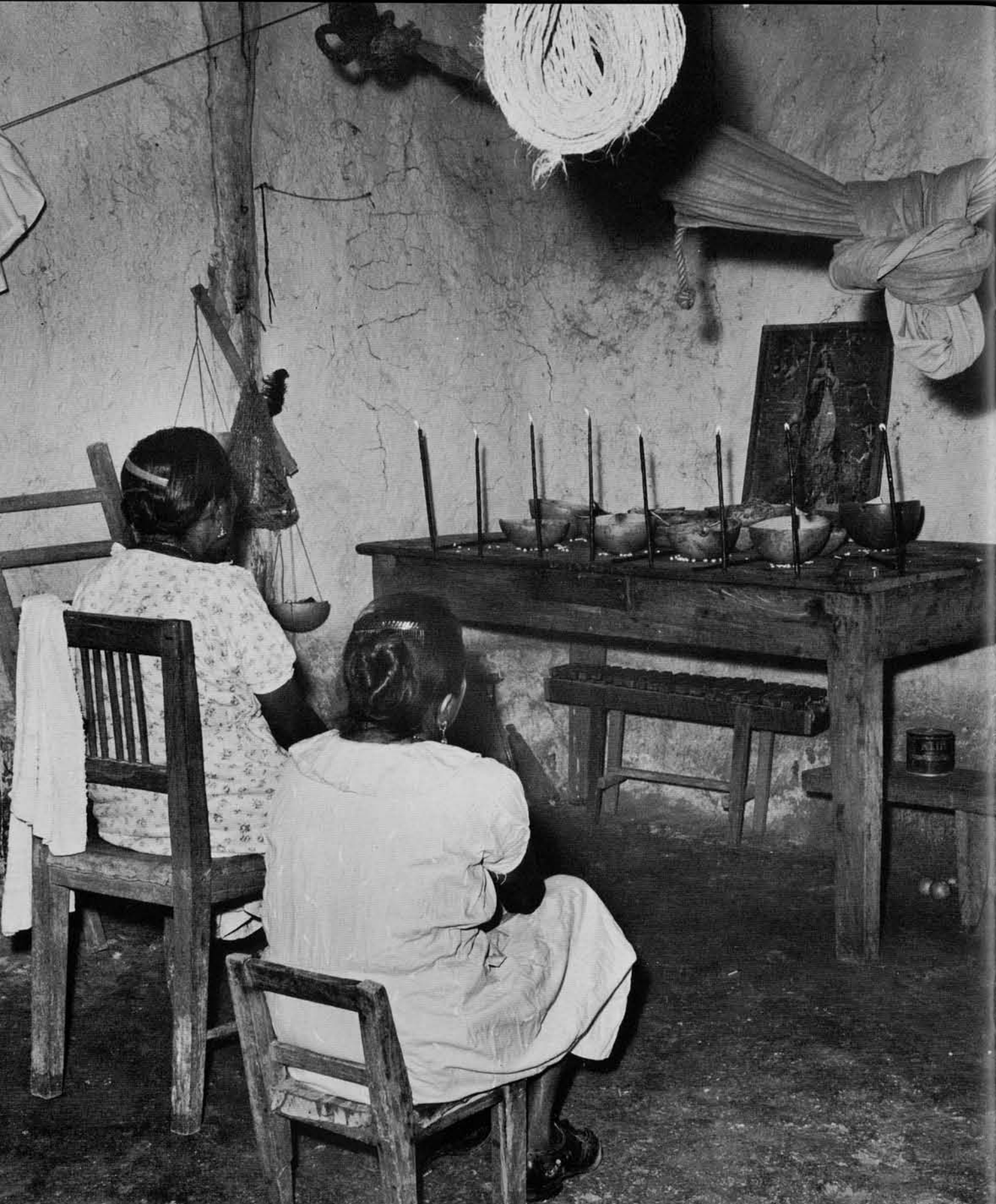
Offering food to deceased relatives. The food includes an atole drink made of black maize, specially cooked meat and vegetables, tortillas, and black beans.

occasion) and to stop any preparation. He did not gather wild bees'-wax for the traditional candle-making, a task of the men. He argued with his wife that the celebration was no longer needed. On the day when everyone was busy with the devotion he went into the forest to work as usual. He returned late in the afternoon, ate, and after closing the doors of the house, the family went to their hammocks. The rest of the town went on quietly with the celebration. Suddenly he heard loud, strange noises, and out of the confusion someone was clearly saying "What shall I do, and where shall I go?" The old man and his wife realized that it was the voice of a dead son. The husband failed the ritual no more and was very devoted thereafter.