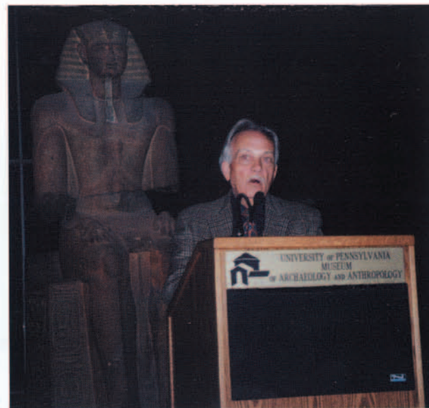
F. Clark Howell gives an address following his acceptance of the Wilton Krogman Award at a UPM reception on April 8, 2000.

the Philadelphia Center for Research in Child Growth (now the W.M. Krogman Center for Research in Child Growth and Development).