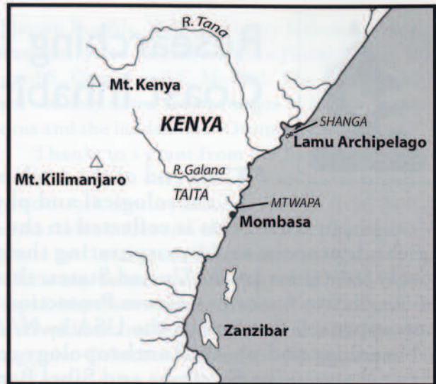
The East African coastal archaeological sites of Mtwapa and Shanga are shown in relationship to the hinterland Taita region.

Reliable techniques now exist for the extraction of DNA from skeletal materials, so 20 small bone samples were removed, with the help of village residents, from the rockshelter specimens. The samples will be compared to the genealogy constructed from interviews for both