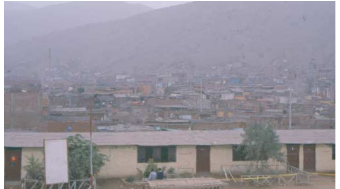
From this view on a pile of backdirt overlooking Tupac Amaru, the rocky hillside surrounding the village can be seen. The close and crowded conditions of the village posed significant challenges for the archaeologists and residents of Tupac Amaru. The archaeologists and village workers excavated in the streets, in the schoolyard, and in a park at the center of the village in order to minimize the impact of the salvage operation.