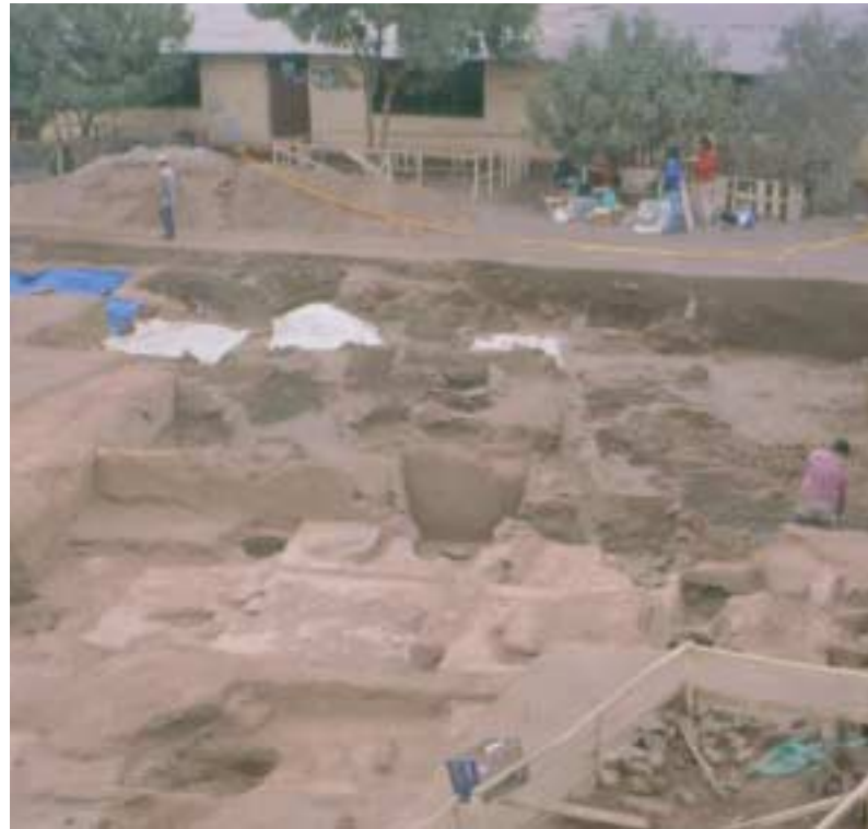
Excavations in the schoolyard of Tupac Amaru uncovered many mummy bundles buried inside and adjacent to pre-Inca structures. The archaeologists were often surrounded by the daily activities of children and teachers, including the occasional stray soccer ball.