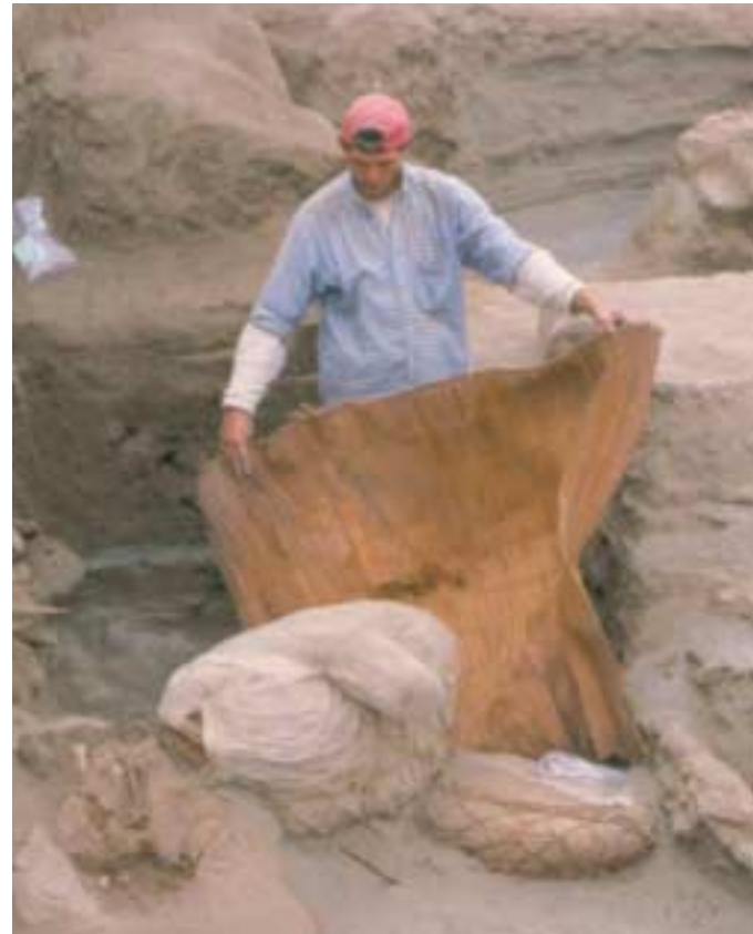
A resident of Tupac Amaru working on the project lifts the reed matting covering this falsa cabeza (false head) mummy bundle. The dry desert conditions on the coast of Peru preserved many of the delicate organic internal and external offerings accompanying the burials, such as weaving baskets, wooden implements, textiles and the reed matting pictured here.

The human remains from Puruchuco-Huaquerones will provide new information about the people living under Inca rule prior to and during the Spanish conquest.