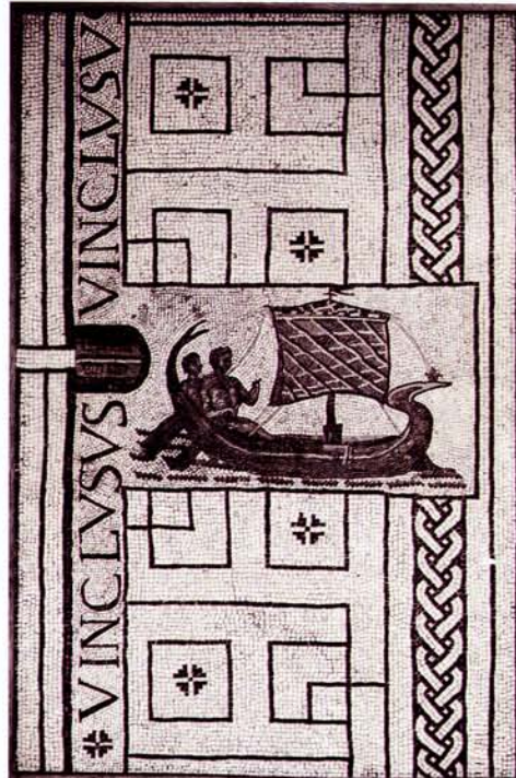
OPPOSITE: Detail of the boat scene from the University of Pennsylvania Museum's mosaic; THIS PAGE: First half of the third-century mosaic (MS 4012) probably found at Utica and today in the University of Pennsylvania Museum of Archaeology and Anthropology. Theseus escaping from Crete.