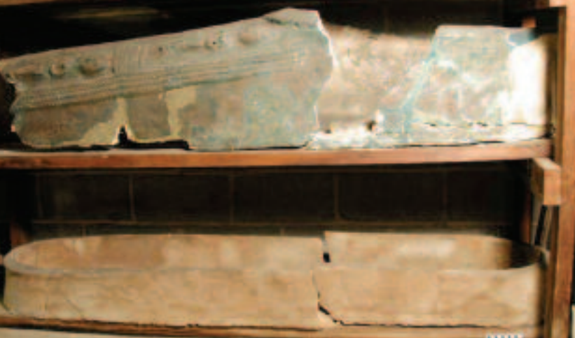
Before their conservation, the coffins were in a sad state.

restorer also employed a plethora of staple-like wire ties across the joins between fragments, and most of these had held over the century, preventing total collapse.