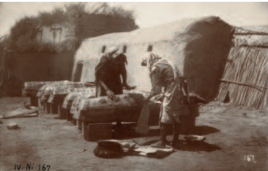
The coffins were prepared for shipment to Istanbul, and then Philadelphia, using a process much like papier-mâché. UPM Neg. #148759.