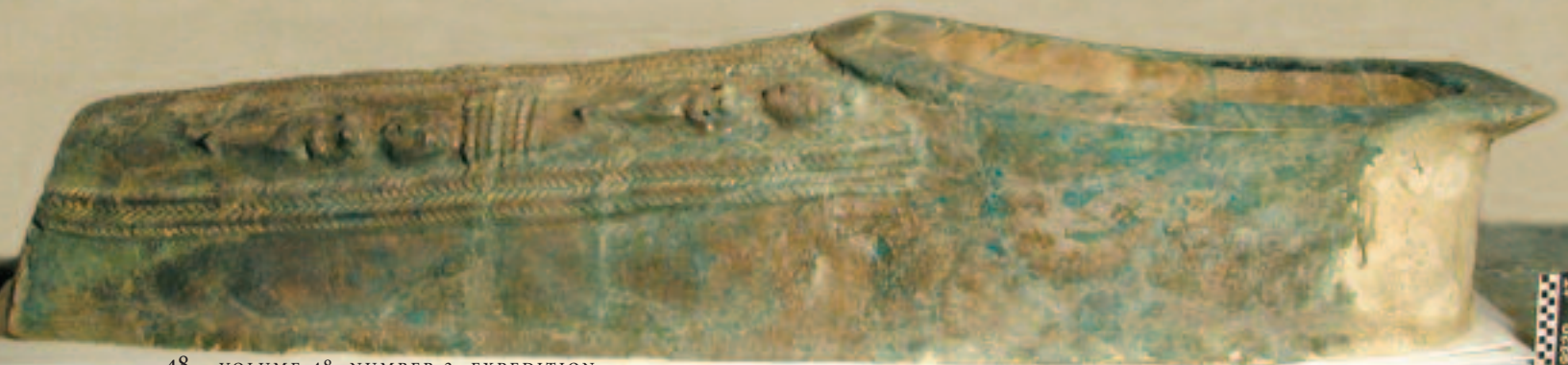
After conservation, the coffins are now, once again, available for study.