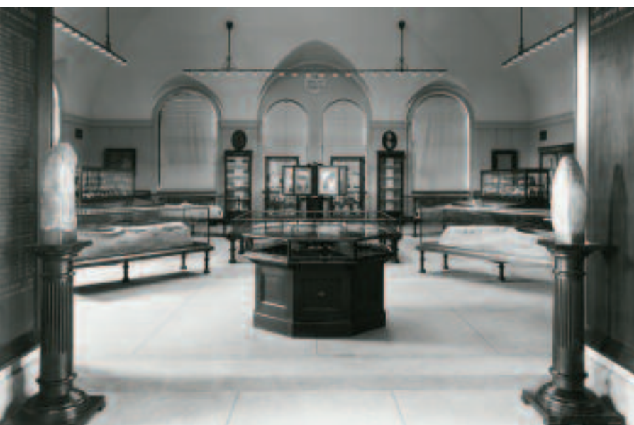
The original (1899) Museum display of the coffins was in the Baugh Pavilion. UPM Neg. #22428.

They remained in the sub-basement, neglected and largely forgotten as older curators and other staff retired or left the Museum.