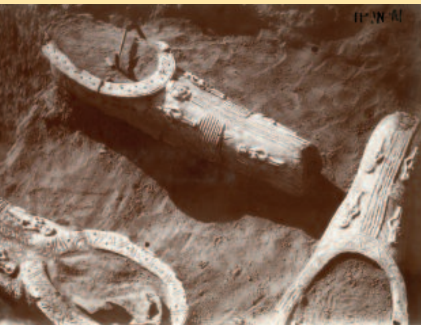
The clay coffins in situ at Nippur. UPM Neg. #148755

Trough coffins came into use in Babylonia during the late Seleucid period. The troughs are long and narrow with straight shallow sides and two rounded ends. Conquering Parthians introduced slipper coffins to Nippur in the 1st century CE. Presumably the corpse was slid into the large oval opening in the top, rather like a foot into a slipper. A rope tied around the ankles and pulled through a hole at the foot end may have aided this process. Two of our slipper coffins are unglazed and have very simple modeled decoration. A third is glazed and has the more distinctive design with female figures, possibly the deity Inanna, whose image on coffins seems to be exclusive to Nippur.