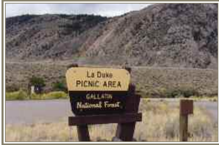
Today the springs are signposted and visitors can stop for a picnic and learn more about the geothermal features of the springs. We hope to collaborate with the Gallatin National Forest Service to install additional storyboards to detail the area's historical importance.

Although a seemingly bucolic location, this spot has continued to generate controversy. In 1981, Malcolm Forbes, the publisher of Forbes Magazine , sold a 12,000 acre ranch to the Church Universal and Triumphant (CUT), a religious organization that combines elements of several religious and philosophical traditions. The next year, Welch Brogan sold the surface water rights to the LaDuke Hot Springs to Michael Kaufman, a CUT member from California. Nine months later, Kaufman resold the rights to CUT for $10. Citing its medicinal qualities, the church wanted to expand the springs by drilling and hoped to pipe the water to their headquarters to heat their offices and for use in a swimming pool. In 1992, however, environmentalists and park officials, worried about the effects such drilling would have on Yellowstone's geothermal system, introduced a bill to the U.S. Congress to prevent drilling within a 15-mile perimeter around the park's border. Although the bill failed, the church abandoned their drilling plans at LaDuke Springs and then eventually sold portions of their property to the federal government. Today the