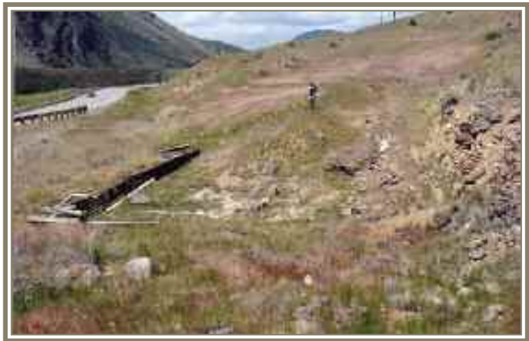
The construction of Highway 89 destroyed whatever was left of the resort. All that remains of the bathhouse are remnants of the foundation and concrete collection boxes that later diverted water from the springs to Corwin.