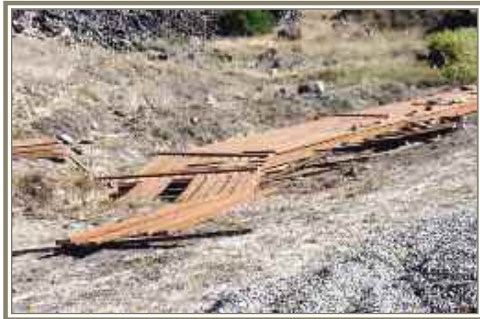
In 2005 the Church Universal and Triumphant covered the exposed soaking tubs of the LaDuke Hot Springs Resort site to preserve them and protect hikers from the hot waters.