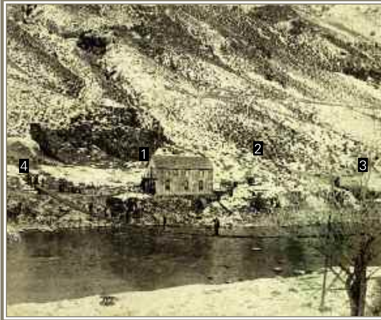
The resort was especially popular during the winter months. The swinging bridge (4) led visitors across the river to the hotel (1) where they could stay the night. Outbuildings to the south included outhouses (2) and structures (3) that probably stored fuel or housed a wagon and horses.