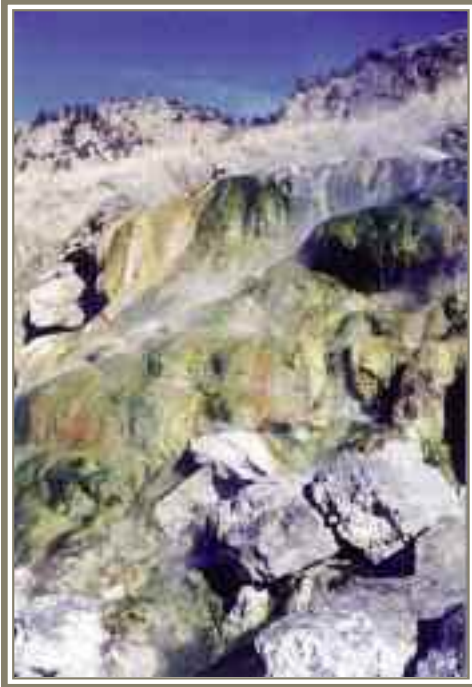
The LaDuke Hot Springs still flow into the Yellowstone River. Bacterial growth has turned the rocks yellow and green.

But using photographs, newspaper accounts, oral history, and some of the physical evidence still visible on the surface, we can reconstruct the resort's plan.