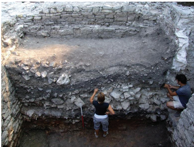
Archaeologists examine the Tower 2 destruction level.

The towering walls that captured Edward Lear's imagination, however, belong to the later Middle Ages when Butrint passed through many hands. So, a second extensive campaign of renewal was executed in the mid-13th century when Butrint was in the hands of the Epirote Despots, probably during the rule of Michael II (1230–1266). Michael II is credited with the refurbishment of the powerful castle of Arta, where the same masonry style consisting of irregularly shaped stones, abundant mortar, densely stacked tile fragments, and circular put-log holes can be observed. A second line of western, seaward defenses replaced the earlier walls damaged in the sack around AD 800. An even greater emphasis upon defense appears late