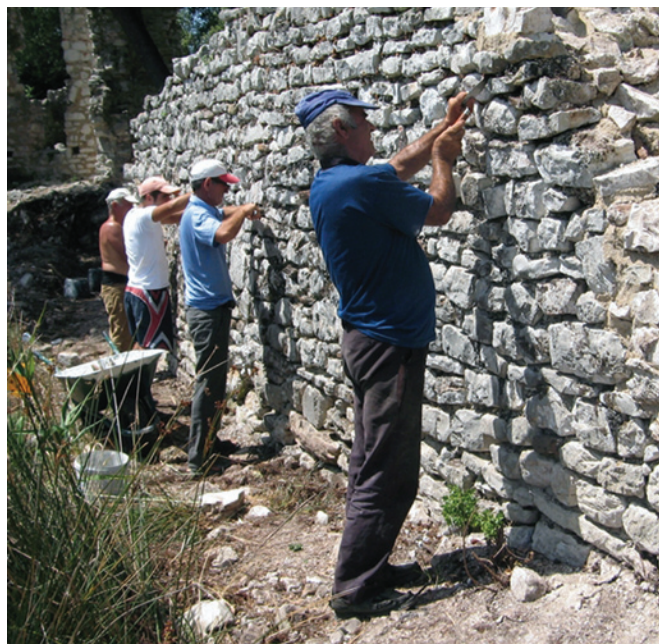
Conservation of the walls is an important part of the plan to preserve Butrint.

The earliest walls, running along the south side of the acropolis, belong to the Archaic Greek age. Constructed of huge blocks, this cyclopean style still confounds us. Are the remaining sections part of a fortified acropolis of the 7th century BC or simply terraces dramatically located on the prominent edge of the hilltop? We incline these days to the latter conclusion. No such uncertainty exists about the exquisitely made Hellenistic walls. Erected around the lower town, these elegant ashlar walls, graced with towered gates, defined the first urban community. The walls provided urban grandeur to the sanctuary to Asclepius, including a theater, which prospered under Republican Roman rule. Intriguingly, when Julius Caesar, then Augustus, founded a colony at Butrint late in the 1st century BC, no new defenses were erected. Quite the contrary, the Hellenistic walling beside the public piazza—the agora, we now know after major excavations—was dismantled to create an enlarged forum.