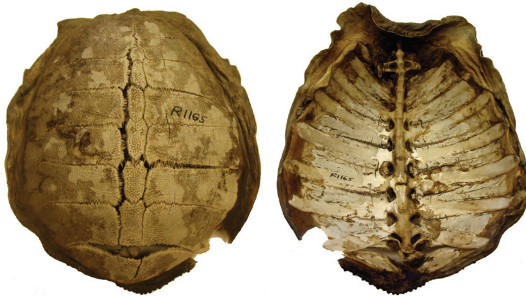
The exterior and interior views of a turtle shell. Notice the various plates or scutes that latch together to form the complete shell. These plates are often recovered individually in archaeological contexts.

woken up. Box turtles have a long tradition as a food source in North America, having been an important component of Indian diets, particularly that of the Iroquois. And some culinary historians claim that European colonists did eat the occasional box turtle, though they may have preferred other varieties. Given their preference for woodland environments, box turtles, like snapping turtles and terrapins, would have been available on the landscape in and around the city, and therefore readily available for those people who did wish to utilize them for culinary purposes.