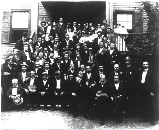
HOBOKEN TURTLE CLUB. A Gathering of the Members.