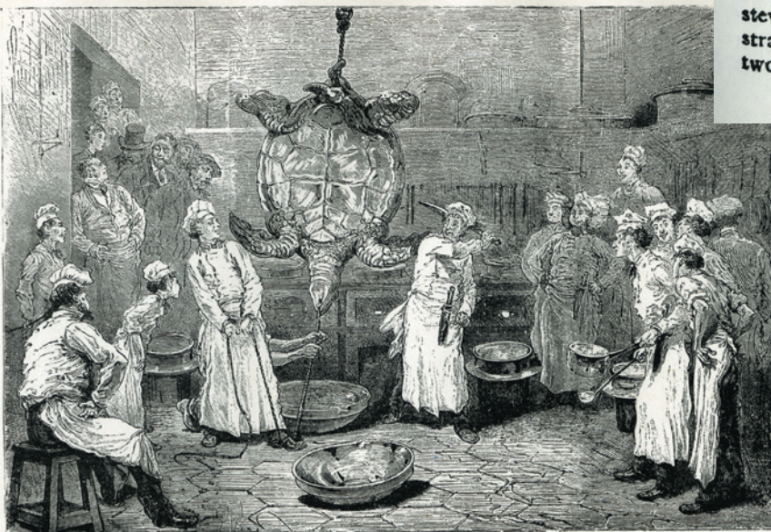
DECAPITATING A TURTLE AT A PARIS RESTAURANT.