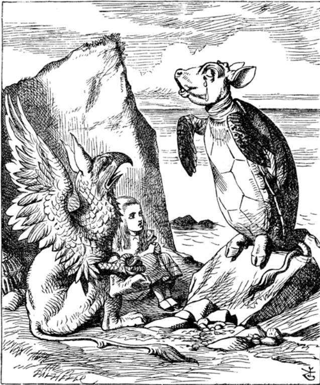
Sir John Tenniel's incomparable etching from Alice in Wonderland brings the mock turtle to life. Mock turtle implied the use of veal, mainly heads and feet, instead of turtle, primarily in recipes meant to simulate turtle soup, the most popular of the turtle dishes. Note the calf's head on the turtle's body. The feet should be those of a calf as well, though they appear a bit more pig-like in this image.

The turtles referred to in these recipes are the sea turtles of West Indian fame, and cookbook author Richard Bradley describes their taste as follows "Its Flesh is between that of Veal, and that of Lobster, and it is extremely pleasant, either roasted or baked." The color of the turtle's raw meat was also quite similar to veal. Given the similarities between veal and turtle meats, it is rather unsurprising that veal broth and meat were ingredients often found in recipes for turtle soup.