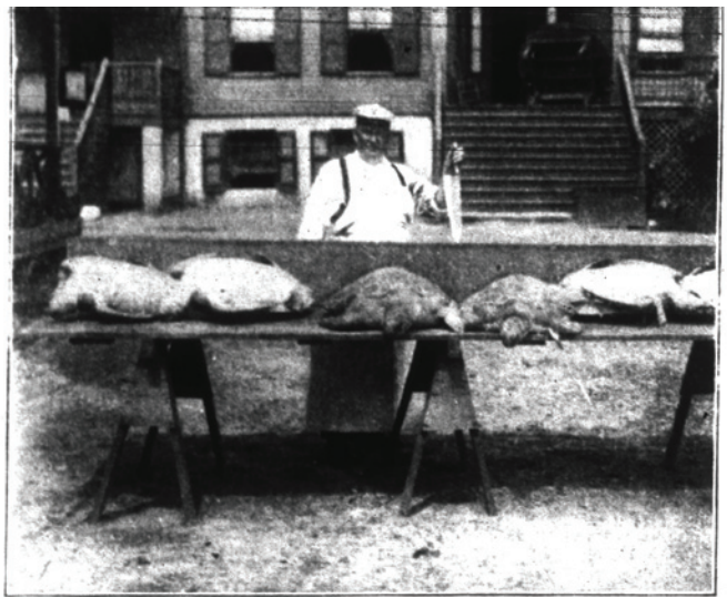
THE DAY BEFORE THE FEAST—PREPARING THE TURTLES.

The Hoboken Turtle Club, in Hoboken, New Jersey, was founded in 1796 and lasted at least through the end of the 19th century. The Club became a venerable part of the local culinary landscape and continued throughout its existence to offer turtle soup and turtle steak dinners to its members.