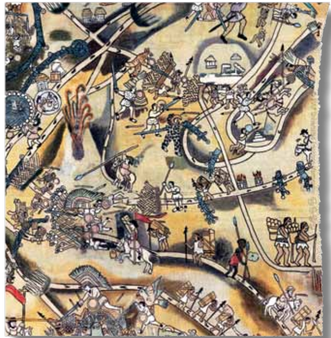
These 16th century painted scenes, part of the Lienzo de Quauhquechollan , show the territories crossed by the Spanish and allied indigenous forces who marched with Pedro de Alvarado to conquer the Maya living in what is now Guatemala.

The legacy of conquest in Yucatan was a patchwork of subjugated communities, some defeated in battle, others who submitted without waging war, and a small number of fiercely independent kingdoms. A group of communities around the Peten Lakes, most notably the Kan Ek' polity, successfully resisted and remained independent of Spanish rule. Even once conquered, however, polities did not always remain loyal to the Spanish crown. The influence of Catholic missionaries and negotiated surrenders held back the final round of military conquest of the interior of the Maya lowlands until the late 17th century. In 1697 a water-borne assault on the Kan Ek' capital of Tayasal, situated on an island within Lake Petén, brought the last independent Maya kingdom under Spanish control.