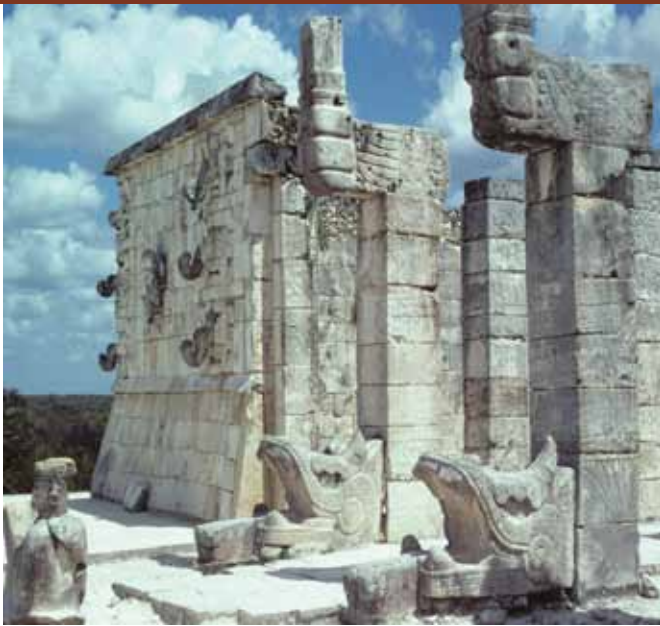
K'uk'ulkan, a feathered serpent deity depicted by these sculptured temple columns at the site of Chichen Itza, was the focus of a popular religious cult that spread throughout the Maya region during the centuries of the Postclassic period.

southern highlands. Postclassic states were sustained by new trade routes that linked the Maya lowlands, highlands, and the rest of Mesoamerica. Managing some of these routes were the Chontal Maya of the west coast of Yucatan, who expanded sea-borne trade circulating around the entire coast of the peninsula, linking ports such as Cozumel, Tulum, and Chetumal. Sea-borne commerce provided more efficient and far-reaching distribution of everyday products, and this Postclassic economy promoted growth and prosperity that transformed Maya society. Across the Maya world, a middle class sector of