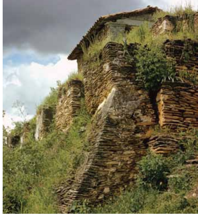
Above, a modern Christian chapel has replaced the original Postclassic temple that once crowned the summit of this pre-Columbian substructure in the Maya highlands. Right, this Mayapan-style incense burner adorned with an elaborately modeled and painted Maya deity dates to the Postclassic period.

The Book of Chilam Balam of Chumayel records that in K'atun 1 Ajaw (1382–1401 CE) the Cocom expelled another noble family, the Xiu, who likely controlled the K'atun-ending ceremonies at Mayapan. This allowed the ruling Cocom to consolidate their power over all aspects of the Mayapan community and economy. The chronicles also tell how during this time the mercenaries controlled by the Cocom abused the people of Mayapan. Later in K'atun 8 Ajaw (1441–1461 CE) the surviving Xiu at Mayapan revolted against Cocom rule in a famous episode of invitation and ambush. All members of the Cocom ruling house were killed except one who was away on