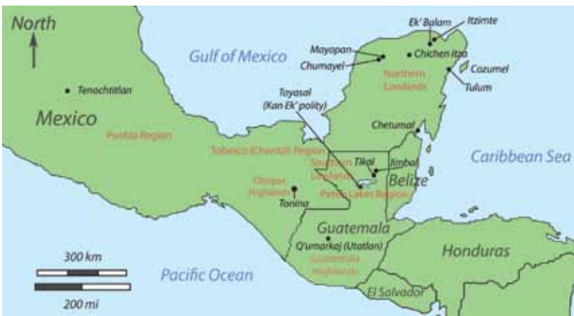
This map of the Maya area shows the location of prominent sites during the Postclassic period.

The Maya recognized how their society had changed. In Yucatan they recorded how their past was a time when “the course of humanity was orderly.” Thereafter the Maya often despaired of the arrival of new peoples and new ideas: “There were no more lucky days for us; we had no sound judgment.” This comes from a Postclassic Maya chronicle, the Books of Chilam Balam , which records history according to the K'atun cycle of the Maya calendar. For the Maya such records of past events were an important means to compile and understand