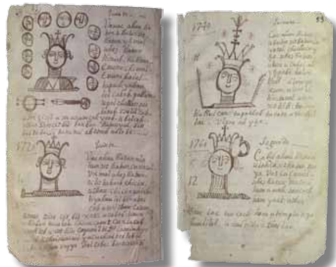
These pages from The Chilam Balam of Chumayel , one of the Books of Chilam Balam , are examples of native accounts that were written down using European script in the Yucatek Mayan language. Based on pre-Columbian records, the accounts were recopied and continued to be used during the period after the Spanish Conquest.

southern highlands. Postclassic states were sustained by new trade routes that linked the Maya lowlands, highlands, and the rest of Mesoamerica. Managing some of these routes were the Chontal Maya of the west coast of Yucatan, who expanded sea-borne trade circulating around the entire coast of the peninsula, linking ports such as Cozumel, Tulum, and Chetumal. Sea-borne commerce provided more efficient and far-reaching distribution of everyday products, and this Postclassic economy promoted growth and prosperity that transformed Maya society. Across the Maya world, a middle class sector of