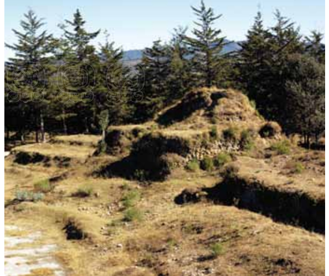
This shows a temple at the ruins of Q'umarkaj (Utatlan) before excavation. Founded in the 15th century by the highland K'iche' Maya, Q'umarkaj fell to the Spanish Conquistadores in 1524.

Postclassic populations increased along the coasts of the Maya lowlands as well as in areas of the highlands, which had not seen the expansive kingdoms of the Classic period. Movements of new people into the highlands brought influences from the coast and northern Yucatan, as well as non-Maya areas of Mexico. The K'uk'ulkan religious cult reached the highlands along with other ideas and trade goods associated with Chichen Itza and its successors of the northern lowlands. Postclassic states in the Maya highlands followed a similar course as those to the north, and often traced real or fictive origins back to