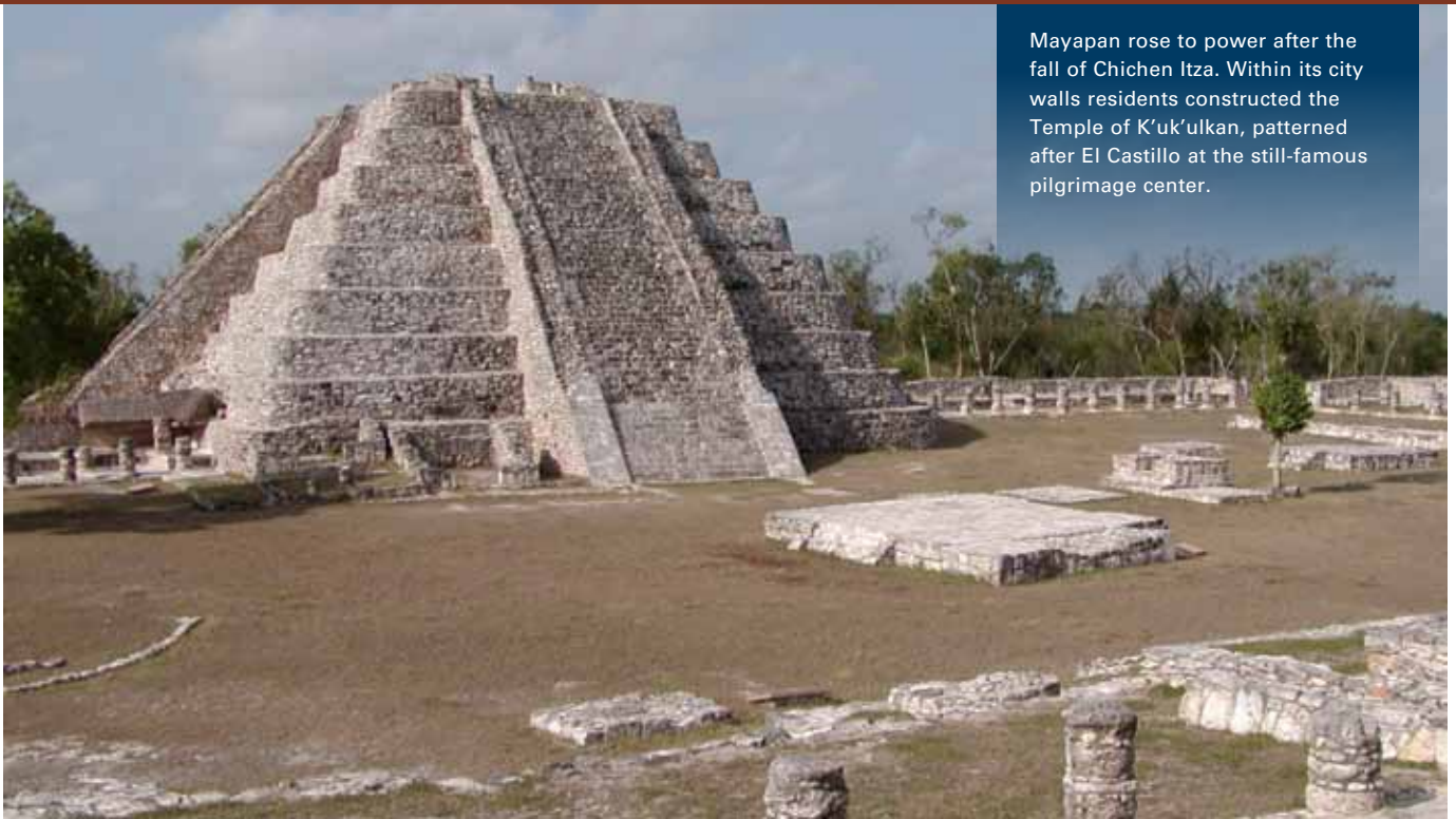
Mayapan rose to power after the fall of Chichen Itza. Within its city walls residents constructed the Temple of K'uk'ulkan, patterned after El Castillo at the still-famous pilgrimage center.

descendant elite groups. Yet, after its fall, this city became a legendary inspiration for later capitals, which continued to develop decentralized political systems during the Postclassic period based on the remembered heritage of Chichen Itza.