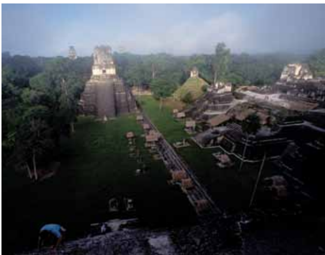
Tikal, like most other Classic cities in the central Maya lowlands, was abandoned by the beginning of the Postclassic.

What brought about this unraveling of the supreme authority held by individual kings and their royal houses? Celebrated for generations as semi-divine figures, royal lords anchored the political and religious systems at the heart of each kingdom. Like the towering ceiba tree—which the Maya believed grew at the center of the world and held together the multi-