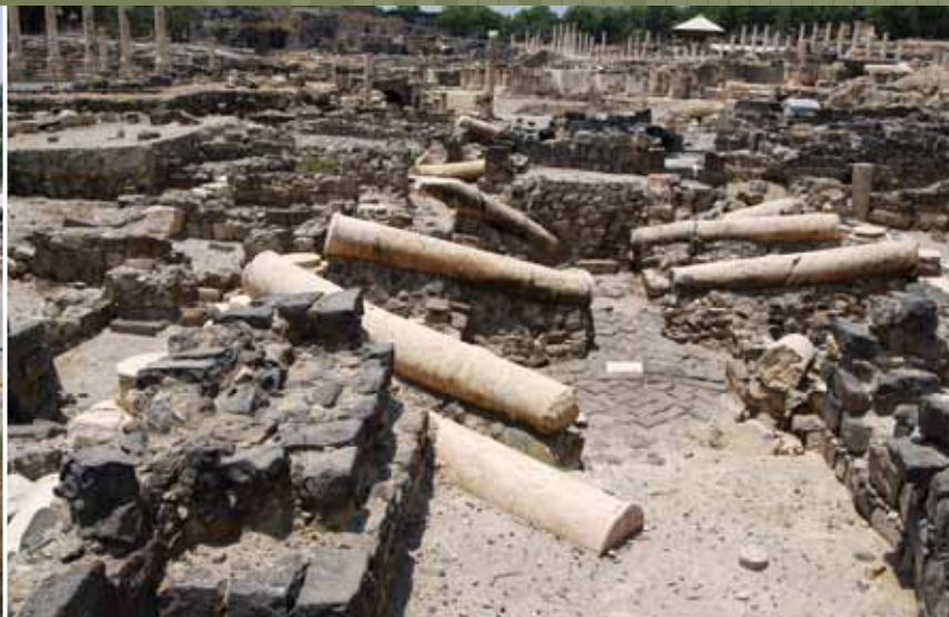
Above left, view from the tell, looking southwest across the Roman city excavated by the Hebrew University of Jerusalem, with the theater in the distance. Above right, excavations in the Roman city revealed fallen colonnades, associated with the destruction of the city in the 749 CE earthquake.

respondence, daybooks, architectural drawings, photographs, and unpublished reports.