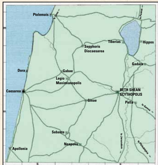
Roman road system showing location of Beth Shean-Scythopolis in Israel. After Tsafir and Foerster, 1997.

Beth Shean reemerged as an important city in the Hellenistic period of the 2nd century BCE, when it became associated with the nymph Nysa, the nursemaid of the god Dionysos. It became part of the Roman state in 63 BCE and continued to prosper well into the Late Antique period; it became the capital of Palestina Secunda in 409 CE with a maximum population of ca. 40,000. The period 330–638 CE in Palestine is usually termed “Byzantine,” referring to imperial rule from Constantinople; the more general term