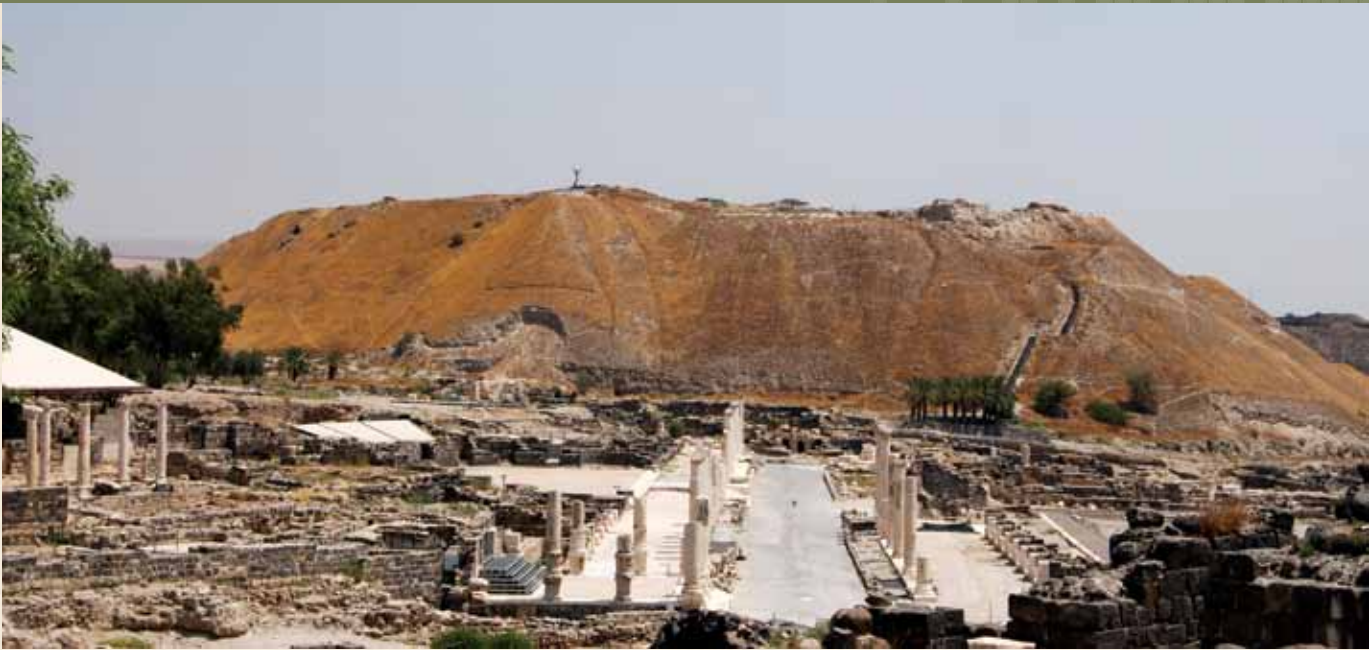
View looking northeast from the Roman city toward the tell. The dead tree on its summit (just left of center) is a relic of more recent “biblical” events—the suicide of Judas Iscariot in the 1973 film Jesus Christ Superstar . The Roman temple and subsequently the Round Church would have appeared immediately above the end of the colonnaded street.

B ETH SHEAN (“HOUSE OF EASE”), ancient Nysa-Scythopolis, sits on an important crossroads in the Galilee and is watered by abundant springs. It is known variously as Beit She’an, Bet She’an, Beth-Shan, Baysan, or Beisan—the name can be transliterated and spelled in a variety of different ways. Occupied as early as the 6th millennium BCE, the site began to figure prominently in Biblical history around 1100 BCE when the Philistines conquered the Canaanite settlement, which they subsequently used as a base for their military operations in the region. The site is strategic in the battles of the following century, and is eventually retaken by King David when it became part of the Israelite Kingdom of David and Solomon. For this period, Beth Shean is mentioned in the Old Testament books of Joshua, Judges, Samuel, Kings, and Chronicles. It fell to the Assyrians in the 8th century BCE, after which occupation was minimal.