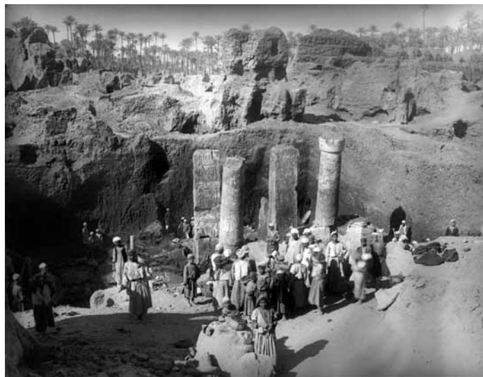
TOP: Beginning of the excavations at Memphis, April, 1915. The Nile is behind the palm trees. (UPM Image #36668) BOTTOM: General view of the Palace of the pharaoh Merenptah (1213–1204 BCE) showing progress of the excavations at the South Portal, 1915. (UPM Image #33944)