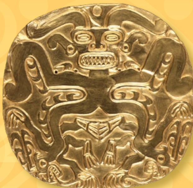
TOP: Polychrome Ceramic Plate; 4,579 artifacts were brought back from Sitio Conte, including three tons of ceramics like this example. Members of the Coclé community placed thousands of ceramic vessels as offerings inside the graves alongside the human remains. Pottery vessels and sherds were used to line many of the burials. UPM object #40-16-1709 (UPM image #246070) measures 5.1 cm h x 33.2cm diam. MIDDLE: Several whale tooth ivory and gold pendants were recovered from Burial 11. From the left, UPM object #40-13-120 is 5.6 cm l; #40-13-124 is 5.4 cm l; #40-13-132 is 6.5 cm l; #40-13-133 is 6.4cm l. UPM image #246031. BOTTOM: Five large gold plaques were found in association with the adult placed at the center of the middle layer of Burial 11. Coclé metal smiths excelled at advanced gold working. To create the embossed low relief image, the sheet metal was pressed onto a softer leather surface using a small stone tool or chisel, then treated with a technique called depletion gilding to create a thin surface of pure gold, which was then polished. UPM object #40-13-4 (UPM image #246032) measures 22.9 cm w.