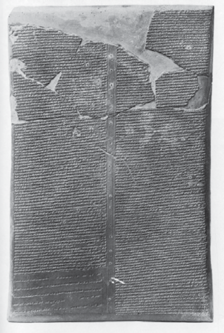
Cuneiform tablet with an account of Sargon's campaign against Urartu and destruction of Musasir in 714 BC. AO 5372 (Louvre Museum). Naissance de l'écriture p. 199 no. 133.