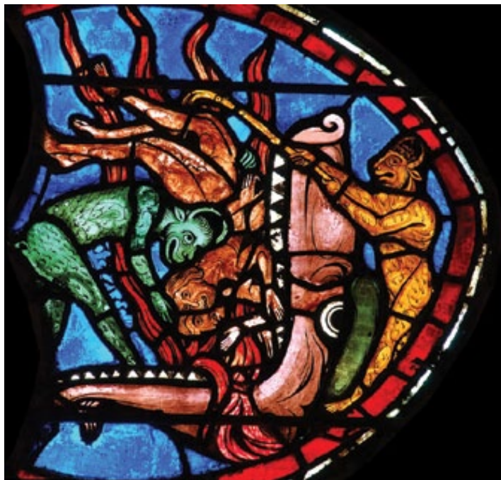
Hellmouth, Bourges Cathedral, 13th century CE. This beast consumes unrepentant sinners..

These texts make clear that knowledge concerning the esoteric nomenclature of beings, structures, and locations in the divine world functioned as the magical key necessary to unlock the door to apotheosis. Thus, Coffin Text spell 1035 states: "As for one who knows this spell for going down into [the paths of the divine world], he himself is a god in the entourage of (the god) Thoth...but as for one who does not know this spell for traversing these paths, he shall be seized by the snare of the Dead." Building upon the earlier Pyramid