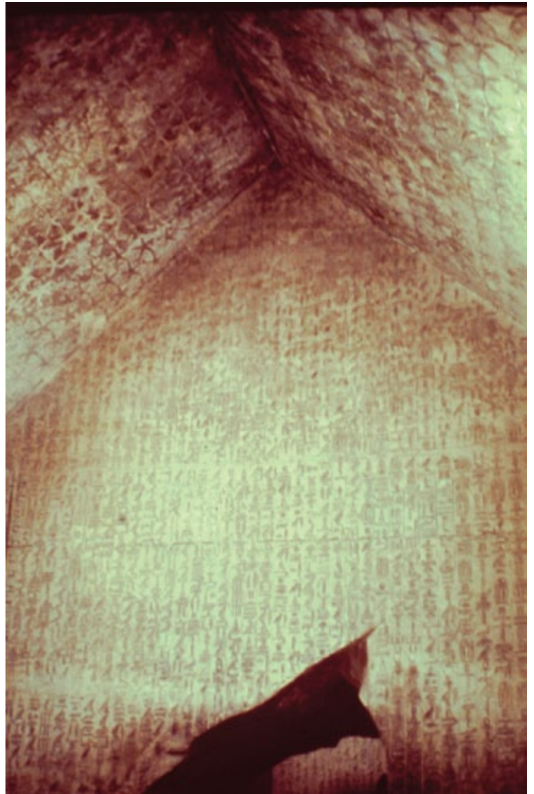
ON PAGE 17: Book of the Dead, Spell 125, Judgment scene. Ma'at, on the left side of the scale, balances with the heart of the deceased, on the right; the demon "She-who-devours" crouches on a shrine to the left. THIS PAGE, CLOCKWISE FROM LEFT: Pillars, naming the king Unas, flank the causeway leading to the dilapidated superstructure of the king's pyramid tomb at Saqqara. Inside the monument, the Pyramid Texts survive in a nearly pristine state, and a private (non-royal) coffin from el-Bersheh illustrates the two "Ways of Rosetjau," which the deceased must traverse in the afterlife.