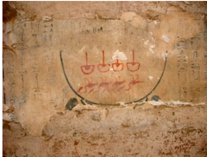
Souls, shadows, and flesh roasting in a cauldron, from the Book of Caverns, fifth division, Cenotaph of Sety I at Abydos.

The Egyptians conceived of punishment in the afterlife, and the resulting annihilation of the Damned, as a cosmic struggle beyond the pale of normal human experience. However, at their core, these beliefs reflected concerns of this world and a fundamentally human need to believe that wickedness will be rewarded in kind: if not in this life, then in the next. It was this need, coupled with a belief in some greater, cosmic framework of ethics and morality that ultimately outlived the traditional religion of ancient Egypt, to re-emerge in later conceptions of Hell as a place of punishment in diverse religious traditions throughout the Near East and Mediterranean. ●