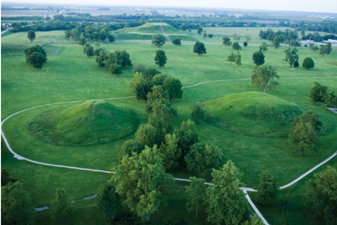
Photograph of the central precinct of Cahokia. The 100-foot-tall Monk's Mound is visible at the top of the photograph. The twin mounds, which sit at the opposite end of the 45-acre plaza, are both at least 45 feet tall.

mounds, and nearby sites—now under the cities of St. Louis and East St. Louis—would have contained at least 60 more. The ceremonial core of Cahokia spans about five square miles and the preserved central precinct consists of a typical platform mound-and-plaza layout with 16 mounds surrounding a 46-acre plaza. A wooden palisade wall enclosed this entire space and served to protect the city from outside attacks. This construction is more than two miles long and would have required over 15,000 logs. More mounds, numerous secondary plazas, and other functional and ceremonial features sit outside this central plaza.