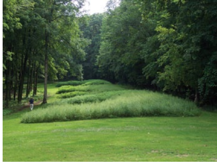
ABOVE: Aerial and ground level images of the Marching Bear Mound Group at Effigy Mounds National Monument, which consists of ten bear effigies, three bird effigies (two are not visible in the aerial photograph), and two linear mounds built along a ridge overlooking the Mississippi River.