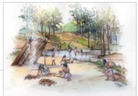
ca. 3500 BCE Watson Brake, LA