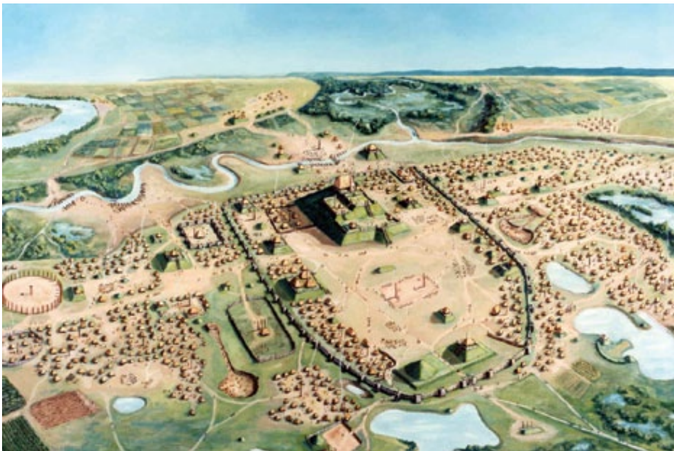
LEFT: Artist's interpretation of life at Cahokia, ca. 1150–1200 CE. View is looking northeast across the central precinct. Image courtesy of Cahokia Mounds State Historic Site, rendering by William R. Iseninger.

shifted from the construction of relatively small, dome-shaped mounds used for burial of the dead, to larger, flat-topped mounds primarily used as foundations of structures. These platform mounds were often carefully laid out in rectangular groups with central open plazas between them. While this shift in mound form and arrangement broadly takes place alongside parallel shifts to subsistence based largely on corn agriculture and governance by hierarchical political systems, the relationship among these transformations remains unclear. My current research at the Smith Creek site in Wilkinson County, Mississippi, seeks to explore these questions by examining some of the earliest