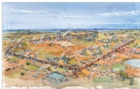
1100–1200 CE Cahokia, Monks Mound, IL