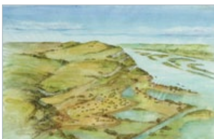
1492 CE Arrival of Europeans