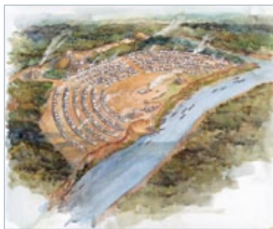
ca. 1300 BCE Poverty Point, Mound A, LA

Just 50 miles northeast of Watson Brake, the Late Archaic (2000–800 BCE) site of Poverty Point contains one of the most dramatic prehistoric landscapes in the United States. The site, named after a local plantation, consists of one large mound, at least four smaller associated mounds, and six concentric earthen ridges surrounding a central open area. Though the large mound had long been known, the true extent of Poverty Point was first recognized when an aerial photograph revealed the incredible ridge structure defining the central plaza. Excavations in these ridges have revealed intact house floors, food remains, and innumerable small, baked clay objects likely used as boiling stones during the cooking process. The large mound just to the west of the ridges is the second largest earthen construction in the Americas. It stands over 21 meters (70 feet) tall and contains approximately 238,000 cubic meters of dirt. Recent excavations have shown that it was built quickly, likely in a matter of months, around 1300 BCE. This rapid construc-