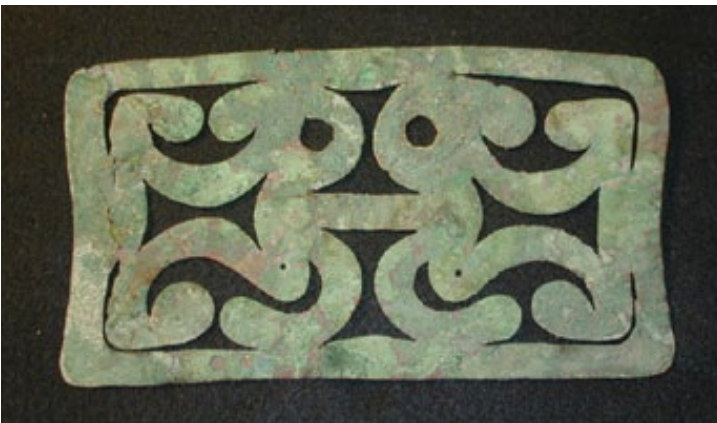
Artifacts associated with the Hopewell Interaction Sphere, from the top, include drilled sharks' teeth, a Prairie Chicken Effigy pipe, and a copper cutout.