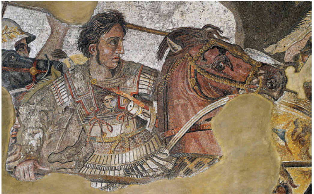
A detail from the Alexander mosaic, recovered from the House of the Faun at Pompeii, depicts Alexander and his horse, Bucephalus. From the Naples Archaeological Museum.

was predestined to be king of Asia, which reached as far as the borders of India. The story of the Gordian Knot allowed historians to present Alexander's adventures and conquests as a divinely sanctioned event. An anecdote similar to that of the Gordian Knot occurred in Egypt in 331 BCE: Alexander trekked across the perilous desert to visit the oracle of Zeus-Ammon at Siwa, who prophesied that the Macedonian would conquer the entire world.