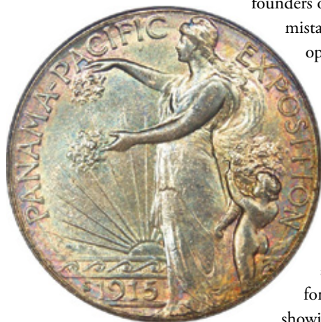
The Panama-Pacific International Exposition (1915) silver half-dollar included a figure of Columbia wearing a Phrygian-style cap.

pileus had become confused with the Phrygian cap. Thus, the latter cap acquired a connotation of liberty, which it had never before possessed. When female personifications of revolutionary France and the United States were created in the late 18th century, the Phrygian cap was chosen for their headgear. Even as late as the 20th century, the cap continued to be used for representations of both Columbia and Liberty on U.S. coins and war posters.