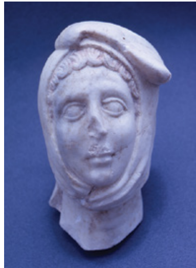
ABOVE: Compared to the Phrygian cap, the pileus cap, shown here on Odysseus, is conical. Red figure vase, ca. 360 BCE, from Naples National Archaeological Museum. LEFT: A marble head from Gordion (Inv. #7131-S-74) depicts a Persian wearing a Phrygian cap.