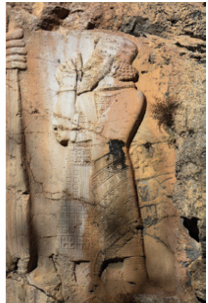
ABOVE: This reconstruction of a woven fabric is based on actual pieces of cloth recovered at Gordion. Illustration by Sam Holzman. RIGHT: A rock relief of King Warpalawas, who ruled Tabal in south central Anatolia in the 8th century BCE, shows the king with patterned textiles like those manufactured at Gordion.

Metamorphoses , and Romans called professional embroiderers phrygiones , after the Latin word for “Phrygian.”