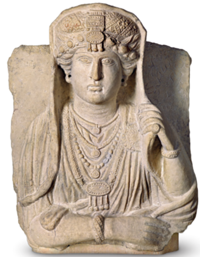
Mortuary Statue, Palmyra, 2nd century CE, PM object B8904.