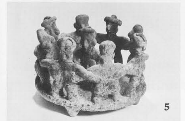
(1) Two-story thatch roof, rectangular house, painted with red, black, and white geometrical designs over orange paste. Height, 28 cm. (2) Two-story house, painted with black-on-white geometric patterns. Height, 18 cm. (3) Small thatch roof, rectangular house, painted with red, black, and white geometrical designs. Height, 14 cm. (4) Figurine group representing a burial or curing ceremony. Height, 13 cm. (5) Circle dance group with a male musician in the center. Height, 9 cm. 1, 2, and 3 are Nayarit culture from Ixtlán del Rio region; 4 and 5 are Colima culture.