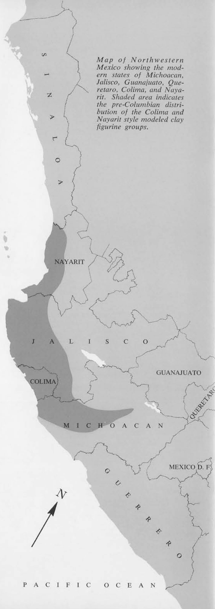
Map of Northwestern Mexico showing the modern states of Michoacan, Jalisco, Guanajuato, Queretaro, Colima, and Nayarit. Shaded area indicates the pre-Columbian distribution of the Colima and Nayarit style modeled clay figurine groups.

It is generally agreed that the ancestors of the American Indians migrated from Asia by way of the Bering Straits, some 25 to 30 thousand years ago. Apparently they came in several waves, and