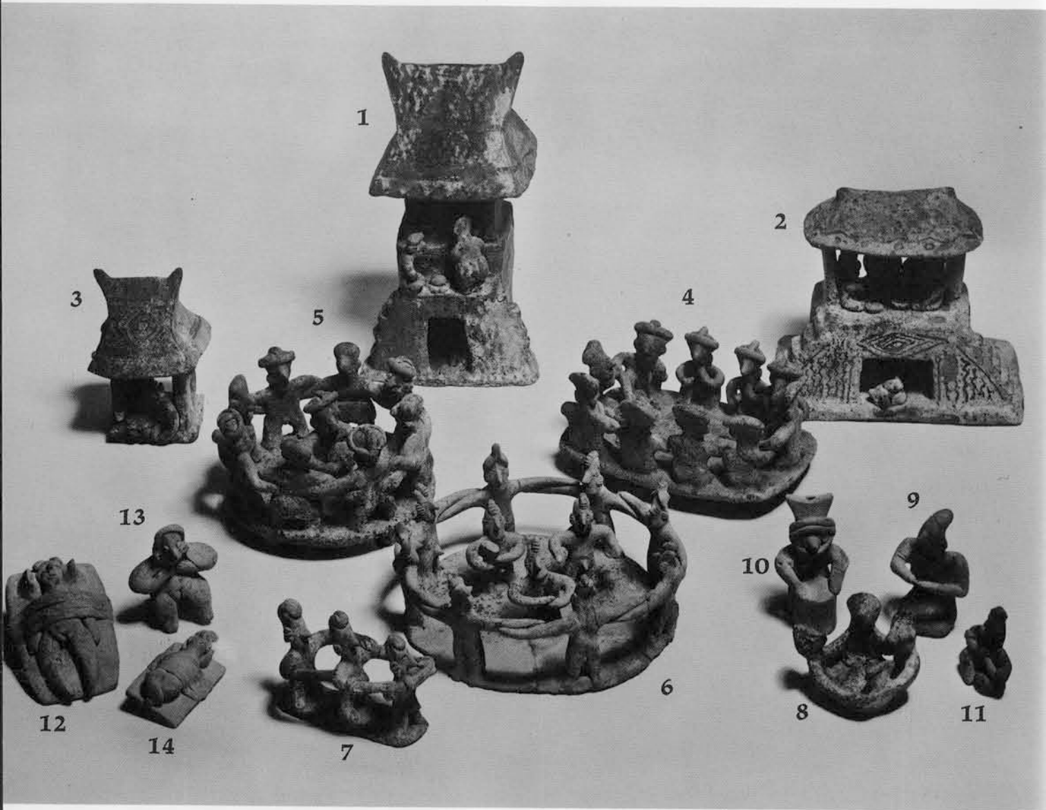
A pre-Columbian west coast Mexican village scene of about 1500 years ago.

in the group. Six steps lead up to the platform of the second floor. The occupants of this house (four women, three men) and the house on the right (five men), are seated around food dishes (1, 2); the stairways and entrances are guarded by fat little dogs. The house on the left, the smallest of the three, (14 cm. high) is occupied by two seated men and one reclining woman (3). Between the two larger houses a figurine group appears to represent either a burial or a curing ceremony (4). A male body is stretched out on the floor and is surrounded by ten seated individuals, six of whom appear to be bare-headed females. The males wear simple headdresses. One