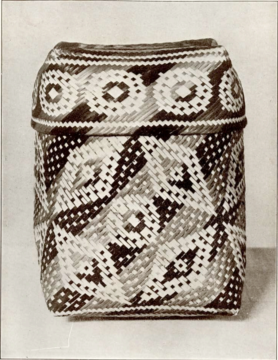
FIG. 14.—Chitimacha basket. Blackbirds' eyes motif.