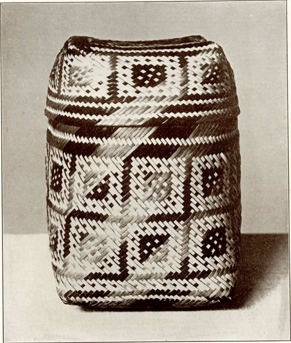
FIG. 13.—Chitimacha basket. Cattles' eyes motif.