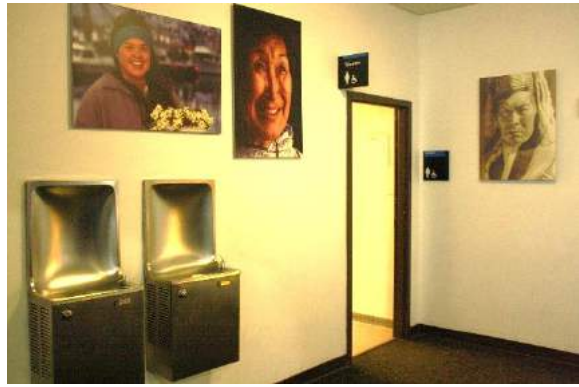
Bathroom or Water Fountain Break