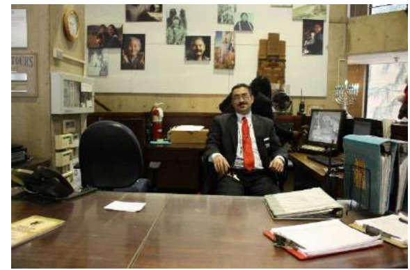
Ask for Help