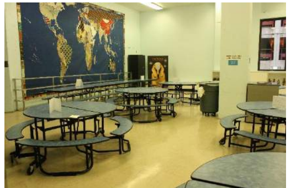
Lunch or Snack Break