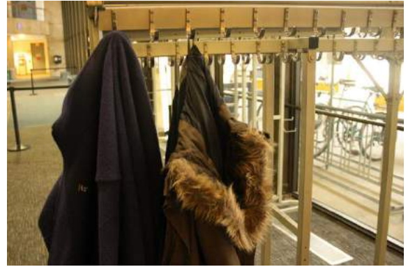
Hang Coats and Put Lunches in Bins