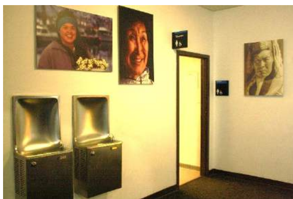
Bathroom or Water Fountain Break